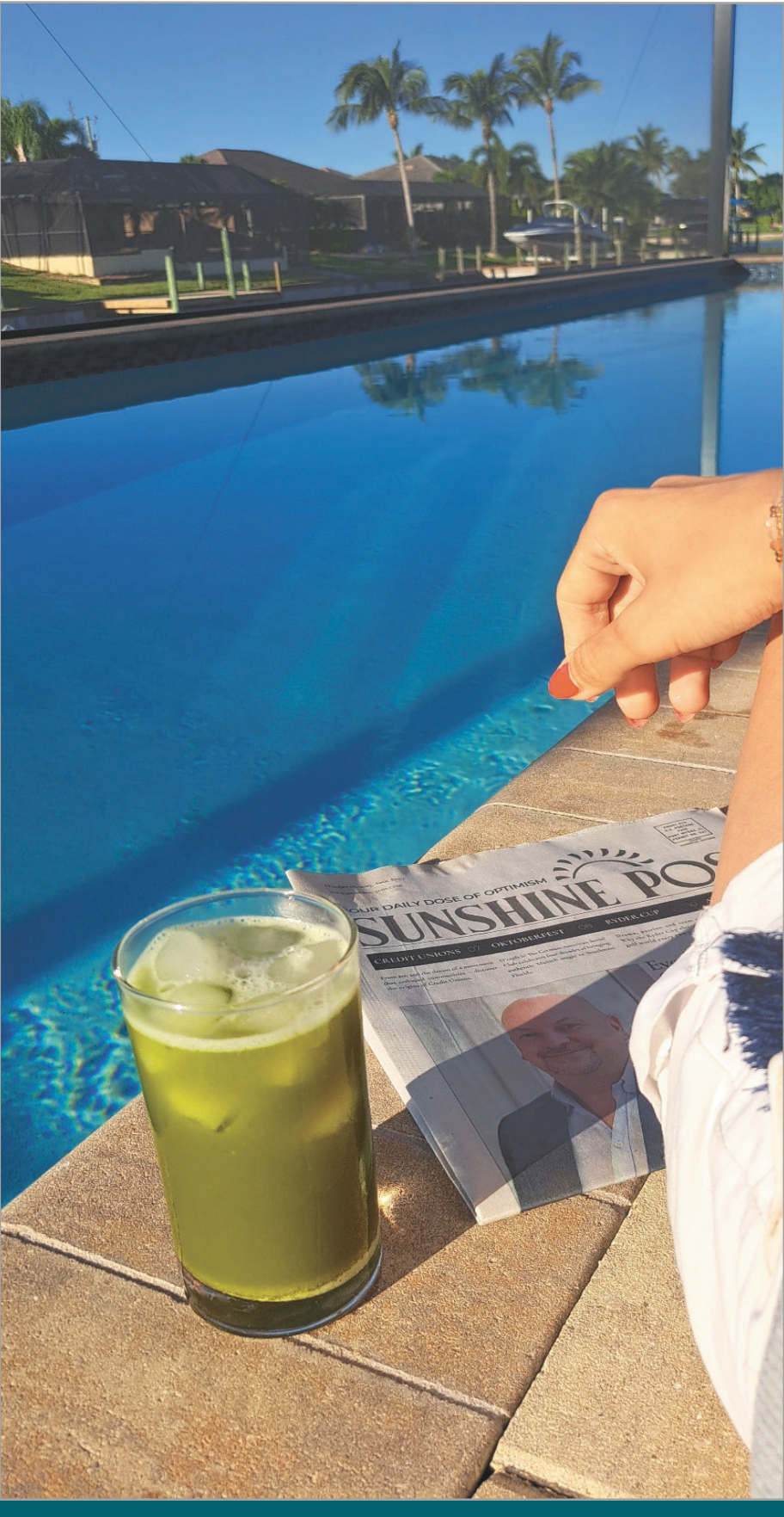
Read more about New Year's Resolutions on Page 14